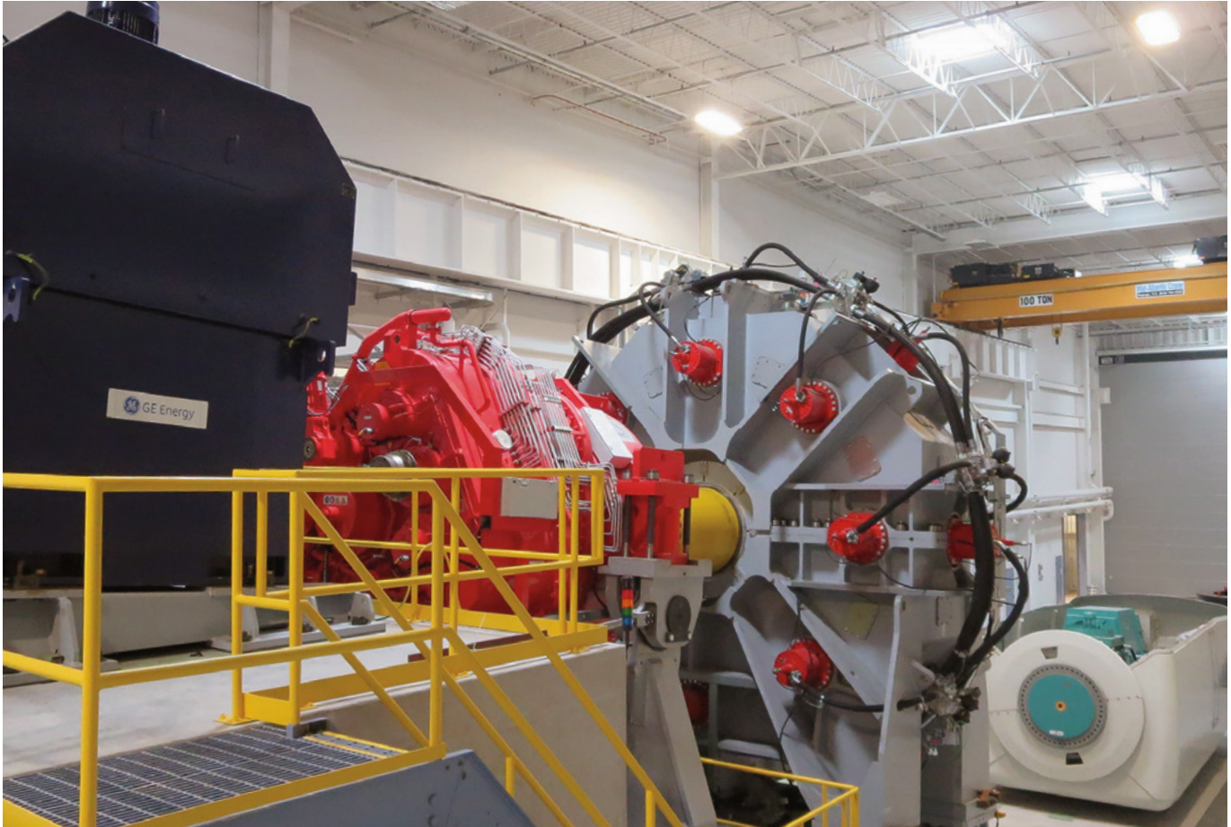
Figure 1. Clemson University's 7.5 MW test bay showing left to right the drive motor, gearbox, load application unit, and nacelle.