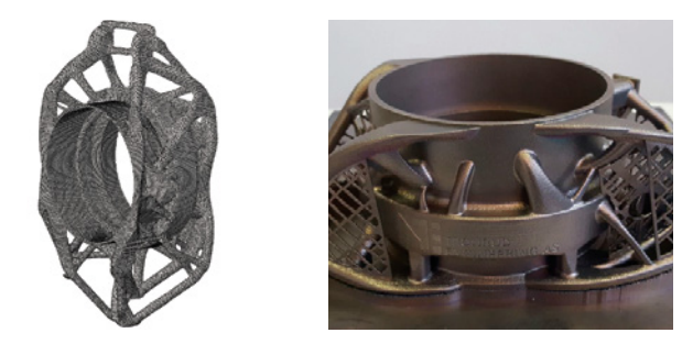
Topology optimization of the front upright in Tosca (left) was performed prior to preparation for 3D printing. The 3D-printed, left-rear upright before support removal and post heat treatment and prior to finishing via machining (right). The final product weighs a little more than a pound (545grams).

Of course, even the strongest wheel and most efficient gearbox are useless without an equally robust upright to support and contain them. This is the domain of Jørgen Eliassen, who is currently pursuing a master's degree in mechanical