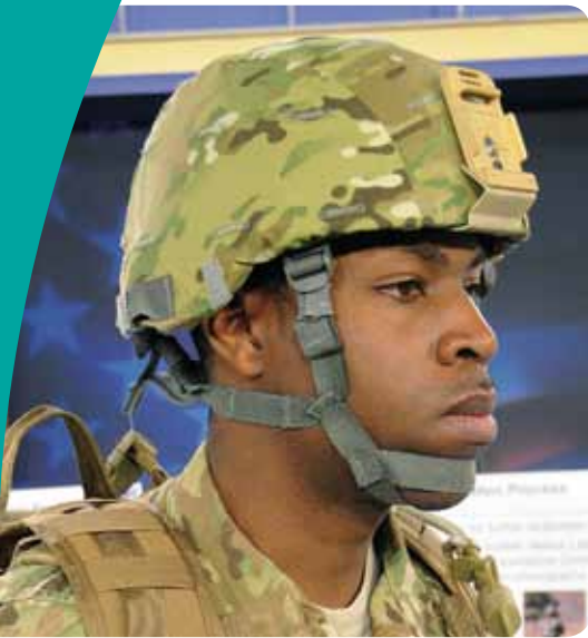
Figure 1. The U.S. Army's Advanced Combat Helmet (ACH).

MIT Man-Vehicle Laboratory uses Abaqus to explore and improve helmet liner design to prevent traumatic brain injury caused by blast events