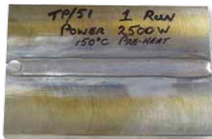
Autogenously welded plate sample.

In a process that involves high temperatures, material phase transformation, and the deposition of material, it's a challenge to produce the perfect weld every time. So engineers are looking for ways to study and predict the effects of different welding techniques on the behavior of the materials