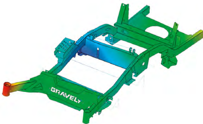
The Abaqus FEA displacement plot of the unit loading in the vertical direction for the front right wheel of the new mower.

Following field tests on an actual mower, the real-world strain-gauge data was incorporated back into the Abaqus model, improving the accuracy of the simulations for a truly realistic representation of the loads that the mower would encounter when cutting a lawn. With high-fidelity Abaqus models of the current frame in hand, the design team could then make